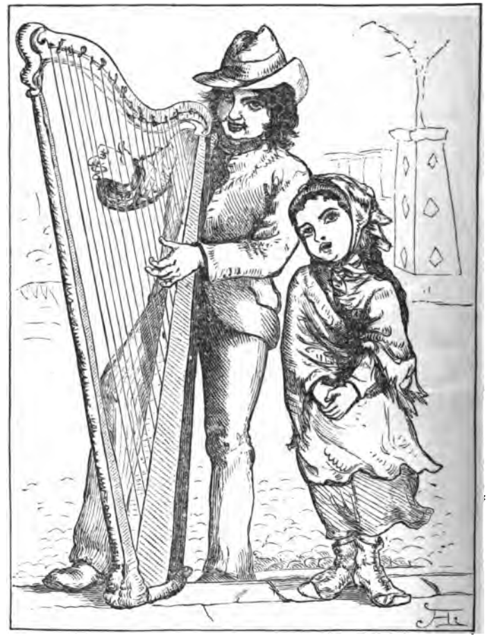
"Sing, Tessa; sing!" cried Tommo, twanging away with all his might. - PAGE 47.

AUNT JO'S SCRAP-BAG: Containing "My Boys," "Shawl-Straps," "Cupid and Chow-Chow." 3 vols. Price of each, $1.00.